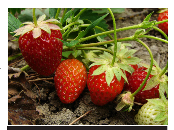
Strawberry growers in California are now permitted to use the pesticide methyl iodine, one of the most toxic chemicals on earth.

Now the strawberry, already one of the Dirty Dozen, is set to become even more toxic. As one of his last acts as governor of California, Arnold Schwarzenegger approved the use of methyl iodide as a pesticide treatment for strawberries.