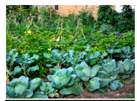
During World War II, large home victory gardens like this one produced half the nation's total vegetable output.

The Food Administration produced a wide range of booklets and information for Americans on how to manage their gardens.