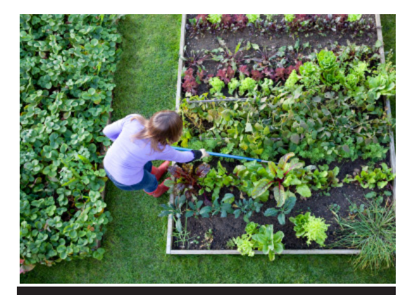
A home garden can save at least $600 in food costs. Many gardeners save much more.

The National Gardening Association (NGA) tracks food prices and garden production. In 2009 they estimated that, on average, a garden produces $600 worth of produce in an average size garden of 600 square feet.<sup>27</sup> This value is increased when you realize that a person needs