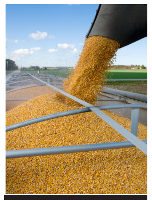
In a six-month period from mid-2010 to early 2011, global corn future prices rose from $3.50 to $7.00 a bushel.

Gawain Kripke, the policy director for Oxfam America, warns that this relatively modest rise is a mere polite warning of what is to come. The Department of Agriculture's chief economist, Joseph Glauber, has said that the rising cost of agricultural products will likely hit American consumers the hardest with a sharp increase in meat and dairy products. As the cost of feed for livestock increases, farmers usually reduce the size of their herds, leading to lower production levels of beef, pork, and dairy products. Currently, 40% of the corn produced is used for animal feed,13 and indeed, prices for these items rose faster in 2010 than for other food products. Glauber predicts that trend will continue into the future as prices for agricultural products continue to rise and as global supplies contract.<sup>14</sup> In a six-month period from mid-2010 to early 2011, global corn future prices rose from $3.50 to $7.00 a bushel. Good for corn farmers ... bad for cattlemen, dairies, and consumers. 15