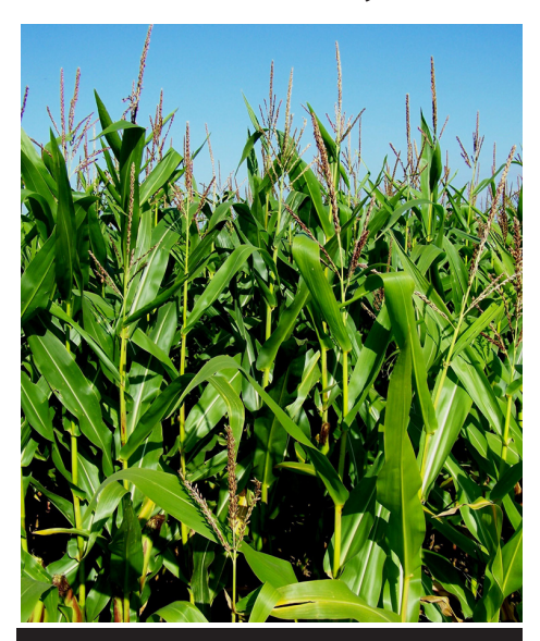
70% of all new corn plantings are going to biofuels, not to food supplies.

In addition to supply shocks, there is more competition now for food products than ever before. And it's not from people, but from their cars. Ethanol is an alternative fuel made from corn in the United States and from sugar cane in Brazil. It's been around for decades, but only in the last few years has it become a major source of fuel for automobiles. The growth of ethanol development has been driven by the spike in oil prices, and consequently, gasoline prices since 2000.