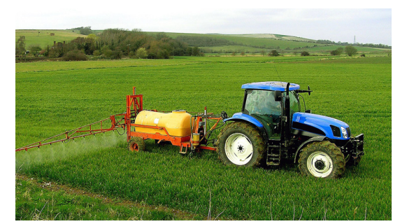
One acre of U.S. farmland is lost to development every minute. Between 2002 and 2007, over 4 million acres were lost, an area roughly the size of Massachusetts.

But despite growing evidence that ethanol is not a realistic alternative to fossil fuels, ethanol and other biomass fuels enjoy a reputation of being an earth-friendly alternative to oil. This is an argument that the government supports.<sup>55</sup>